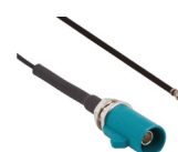
FAKRA to AMC4