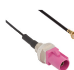
FAKRA to AMC