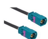
HSD to HSD