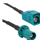
FAKRA to FAKRA