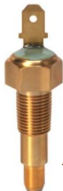
TRS-P Type Thermal Switch

The thermal switches are available in various voltage ratings, form factors, and trip points. They also come in normally open or normally closed configurations. So check out our series of thermal switches and you might find that you don't have to put in a microcontroller (and trust me, I love me some microcontrollers) just to turn on a cooling fan. With the introduction of the TRS-P type of switch you can now just screw the sensor into a radiator or other thermal manifolds using standard threading, we've even made the mechanical part of it easy!